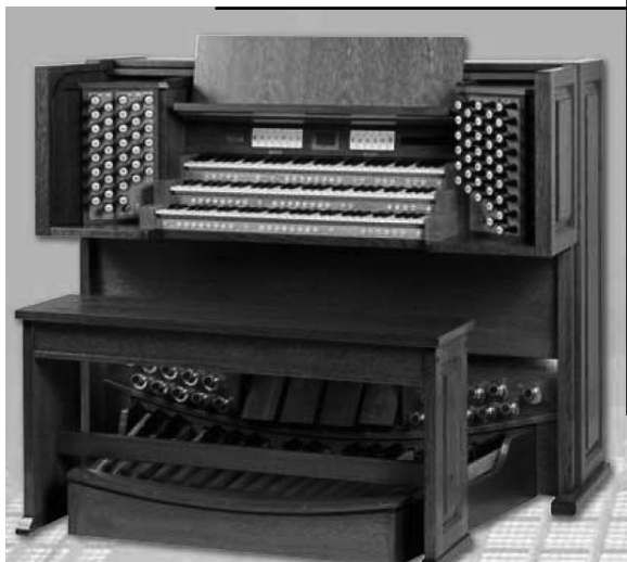
Rembrandt 397 Epiphany Lutheran Church Baltimore, Maryland

European quality and design now in America